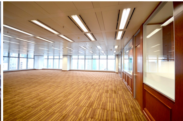
For identification purpose only